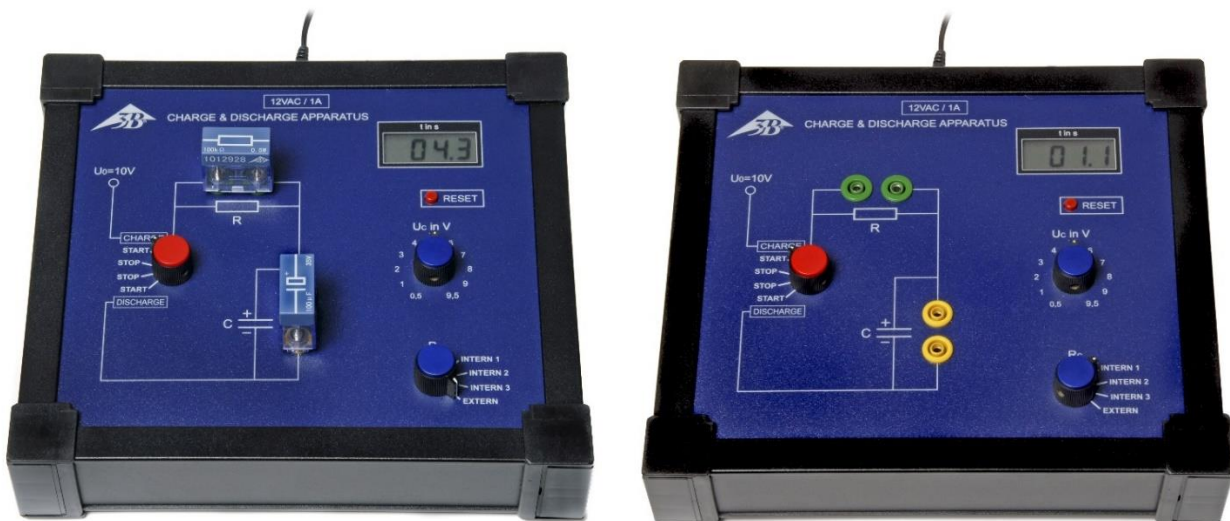
Fig. 1: Charge/discharge equipment in operation with external (left) and internal (right) resistor/capacitor pair.