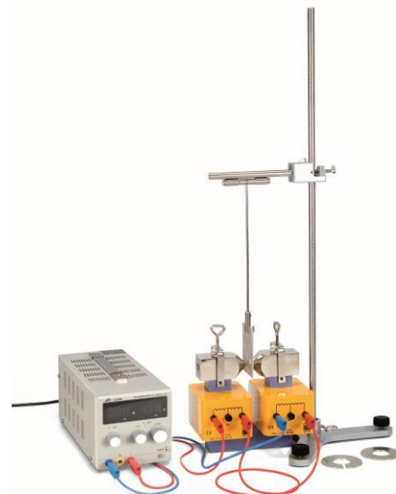
Fig. 2 Set-up Waltenhofen's pendulum