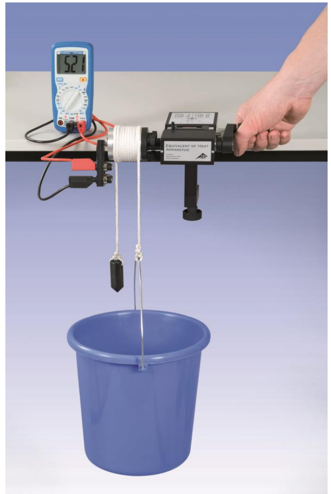
Fig. 1: Experiment set-up