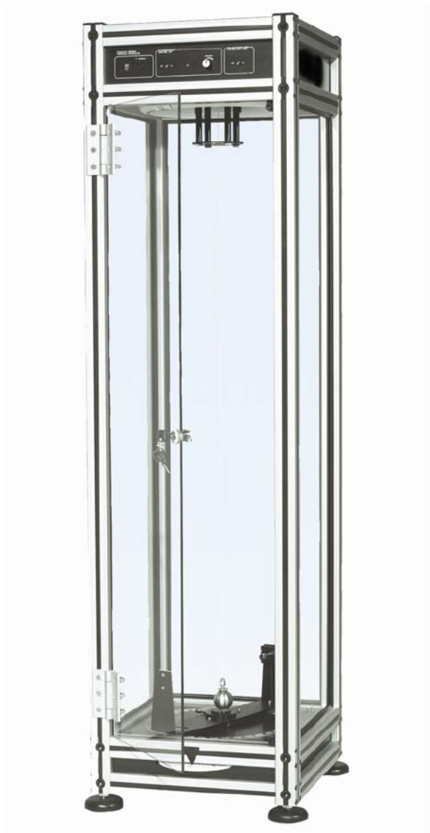
Fig. 1 Foucault pendulum