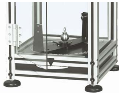
Fig. 3 Light source for projecting a shadow, observation screen and angle measurement disc for Foucault pendulum