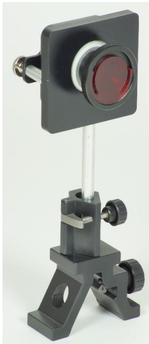
Fig. 2: Fully assembled camera module.