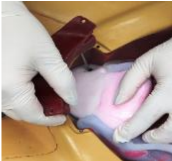
Insert uterine/pelvic lock and (2) screws (screws optional if using abdomen) DO NOT OVER TIGHTEN