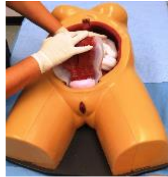
Place intestines behind uterus