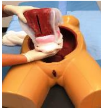
Insert uterus into simulator base