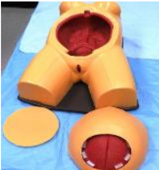
Image of Abdomen incision platform with insert