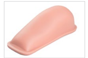
Exchangeable lifelike silicone skin