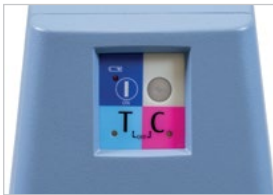
Providing both training and control modes for an immediate or subsequent performance check