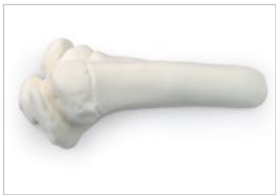
Realistic anatomical landmarks such as acromion and humerus

➤ INTRAMUSCULAR INJECTION CAN BE PRACTICED REALISTICALLY WITHOUT A REAL PATIENT!