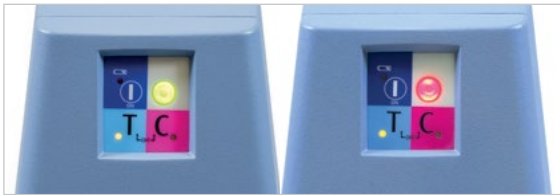
Audio-visual feedback on the injection performance regarding site, depth and bone contact