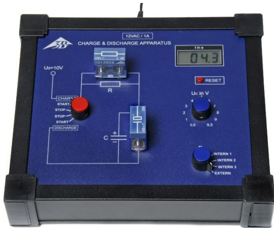
Fig. 1 Measurement on an external resistor-capacitor pair