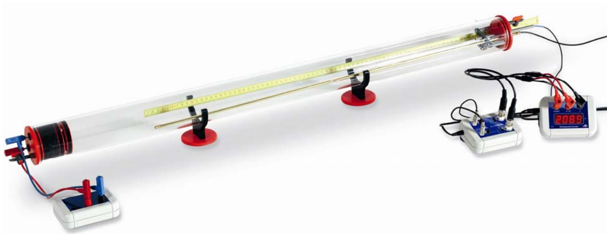
Fig. 1 Experiment set-up with Kundt's tube