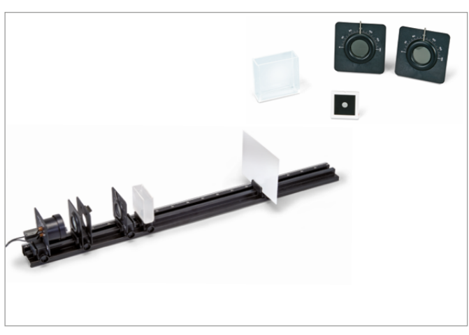
Visibility of polarized light in turbid water