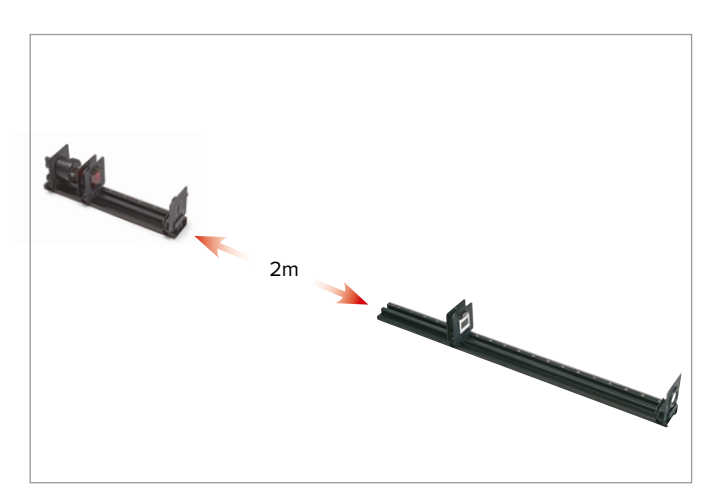
Diffraction by a multiple slit

PLEASE ASK FOR QUANTITY DISCOUNTS ON CLASS SETS OF 8 PIECES OR MORE.