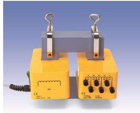
Fig.1 Demountable transformer