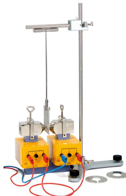
Fig. 2 Waltenhofen's pendulum