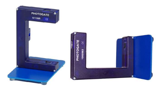
Fig. 3: With holding plate e.g. in experiment with torsion apparatus or reversible pendulum