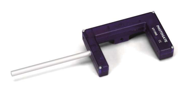
Fig. 1: With stand rod and any kind of stand apparatus, e.g. for experiments with air track