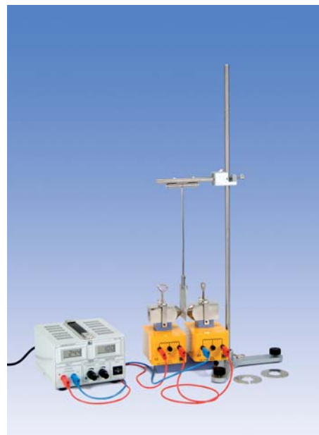
Fig. 2 Set-up Waltenhofen's pendulum