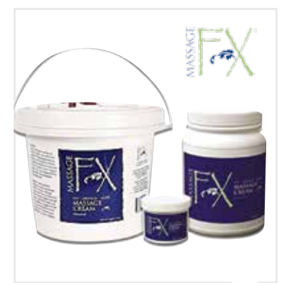
Massage FX Cream – W42000C 4oz, 28oz, ½ Gallon, Gallon, 5 Gallon sizes. From $6.65