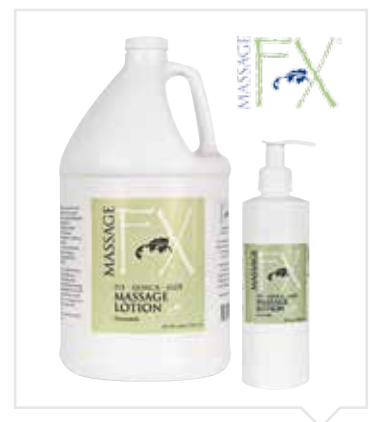
Massage FX Lotion – W42000L 8oz, ½ Gallon, Gallon, 5 Gallon sizes. From $6.99