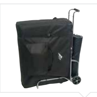
Earthlite® Table Cart – W68032 Cart fits most portable massage tables. Fully assembled, has a telescoping, padded handle and folds compactly for storage when not in use. Comes with a bungee cord to attach a bolster to the cart. Bolster and table sold separately. $69.00