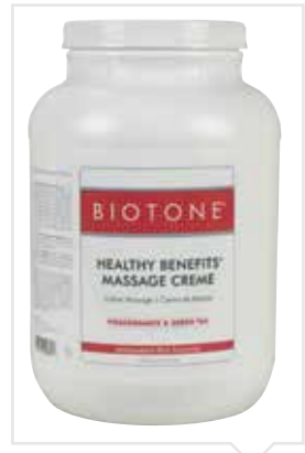
Biotone® Healthy Benefits Creme – W67436HC 7oz, 14oz, Gallon sizes. From $12.05