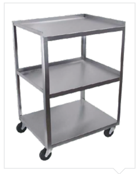
3 Shelf Stainless Steel Utility Cart – W56105 Polished stainless steel construction with swivel casters. Available with or without handle. 21 x 16". $192.00