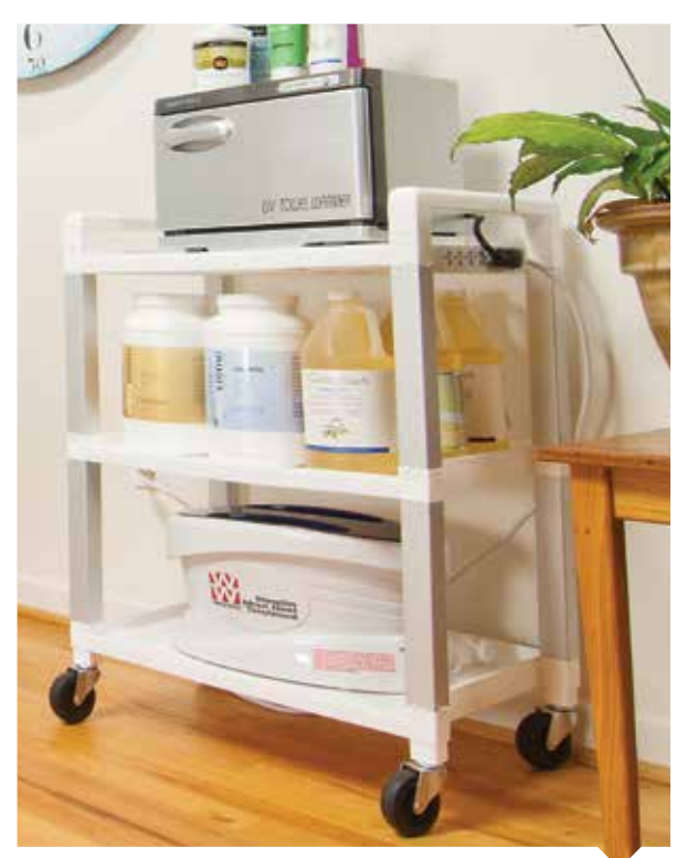
3 Shelf Poly Cart with Power Strip – W56110P Poly/aluminum construction with 3" swivel casters and built-in push handles on top shelf. 21 x 15 x 30".

Need Different Specifications? More heating units & packs available online at 3bscientific.com