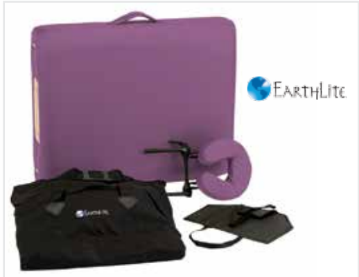
Earthlite® Avalon XD Table Package – W68001 Package Includes: Flex-Rest Adjustable Face Rest, Hanging Arm Sling and Standard Single Pocket Carry Case. Also available in a tilt back version. Available in black, burgandy, teal, vanilla creme, mystic blue, hunter green, and amethyst. From $409.00