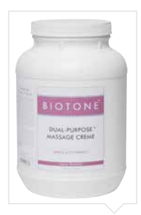
Biotone® Dual Purpose Creme – W67430DP 7oz, 14oz sizes. From $15.55

Therapy Crème – W67431ATC 16oz, ½ Gallon, Gallon sizes. From $18.75