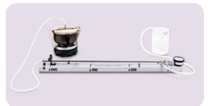
Fig. 3: Set-up with steam generator