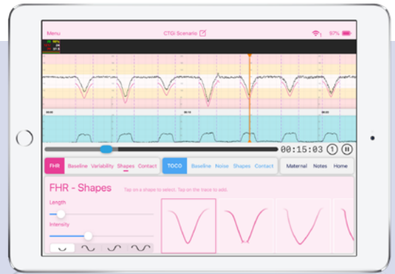
Fetal Heart Rate